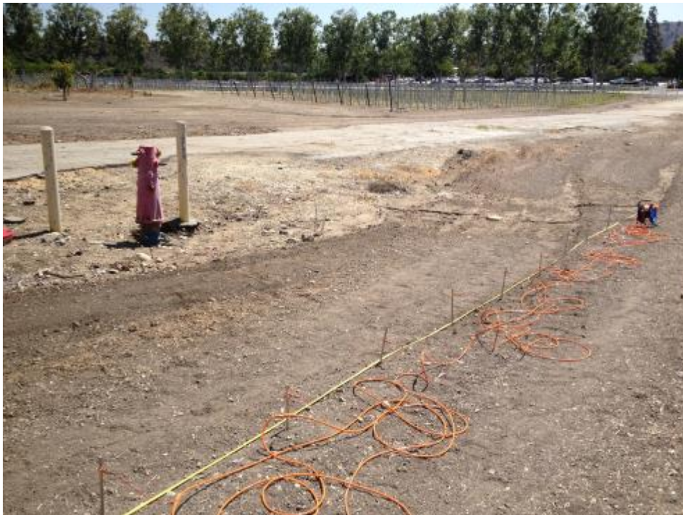
Figure 1 Properly setup survey